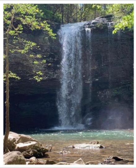
Left: Cherokee Falls Right: Hemlock Falls

The hike then proceeded to the West Rim Trail which is about 4.5 miles long. There were great views of Trenton and Lookout Valley along the trail. The group stopped at a nice sunny overlook for lunch around noon about halfway through this part of the hike with temperatures in the 60's by then. With completion of the West Rim Trail, the hikers then started down the Waterfalls Trail, dropping about 400 feet in elevation via a series of steps and paths to view Cherokee and Hemlock waterfalls in the canyon. These are very impressive waterfalls both falling over 60 feet off sheer cliffs. There were tremendous flows due to previous rain and below left is a picture of the hikers at Cherokee Falls.