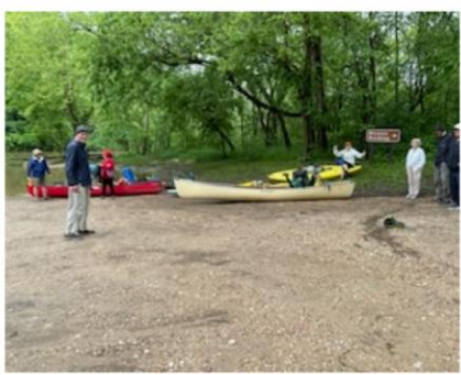
The skies were somewhat clear and we had plenty of time to set up camp and eat supper. Jack had placed a marker at the water's edge to determine if the water was rising or falling. Sue walked down to her kayak to retrieve an item and noticed that the river had risen about two feet already. We quickly moved all the craft to higher ground, just as the rain and lightning began again. For another two or three hours it poured.